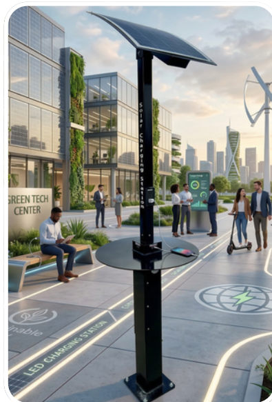
Capable of Charging 10 Devices Simultaneously