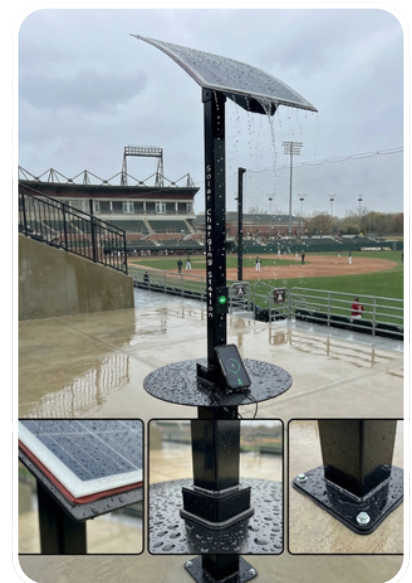
Water Resistant Enclosure