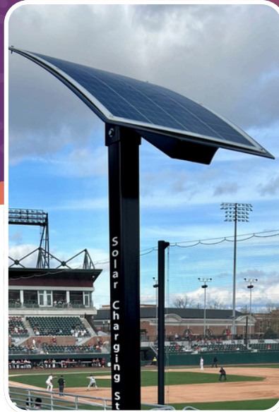
60-Watt Polycrystalline Solar Panel