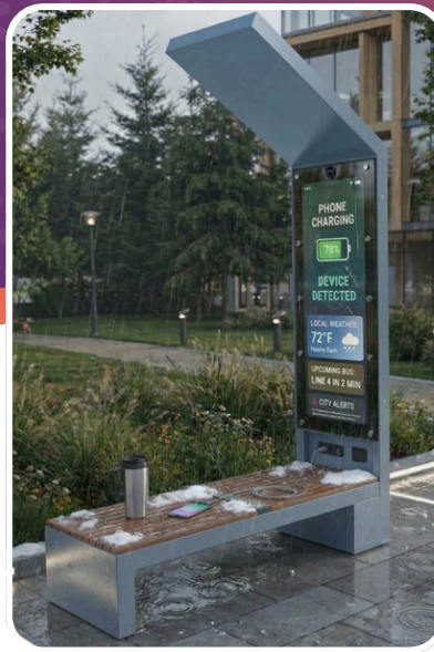
Weather and Vandal-proof