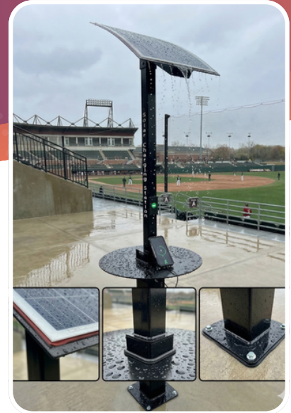
Wet & Over- Temperature Protection