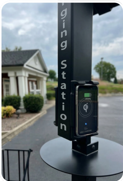
Wireless Charging Cradle