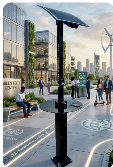
Capable of Charging 10 Devices Simultaneously