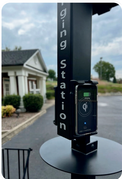
Wireless Charging Cradle