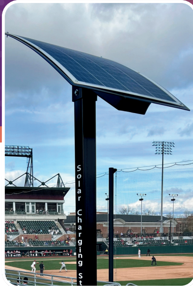
60-Watt Polycrystalline Solar Panel