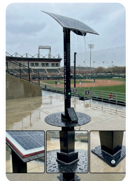
Water Resistant Enclosure