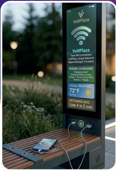
Inbuilt WiFi & Charging Facility