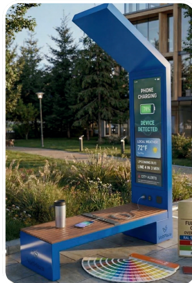
Available in Every RAL Color