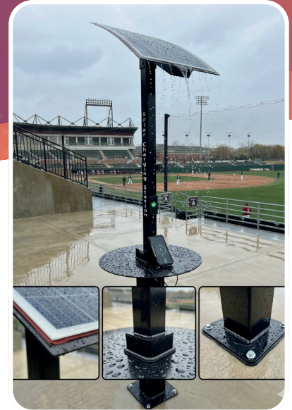
Wet & Over- Temperature Protection