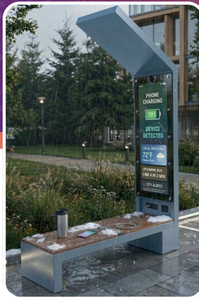
Weather and Vandal-proof