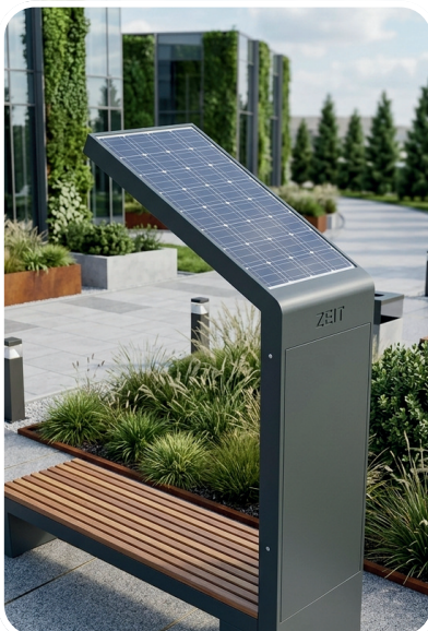
Powered by Solar Energy