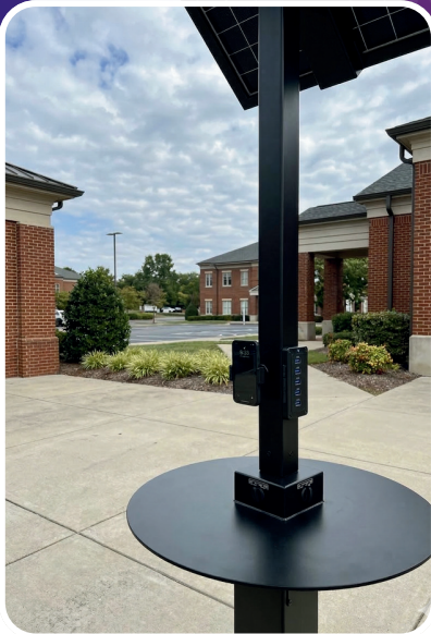
5 Dual USB 3.0 Rapid-charge Ports